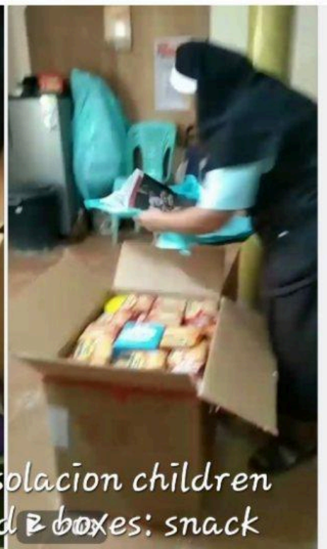
For Consolacion children received 2 boxes: snack