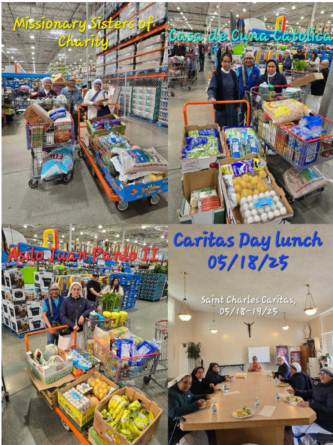
It will take more or less 75 days to reach Cagayan de Oro, Mindanao region ( 1 international ship and then 1 local ship)