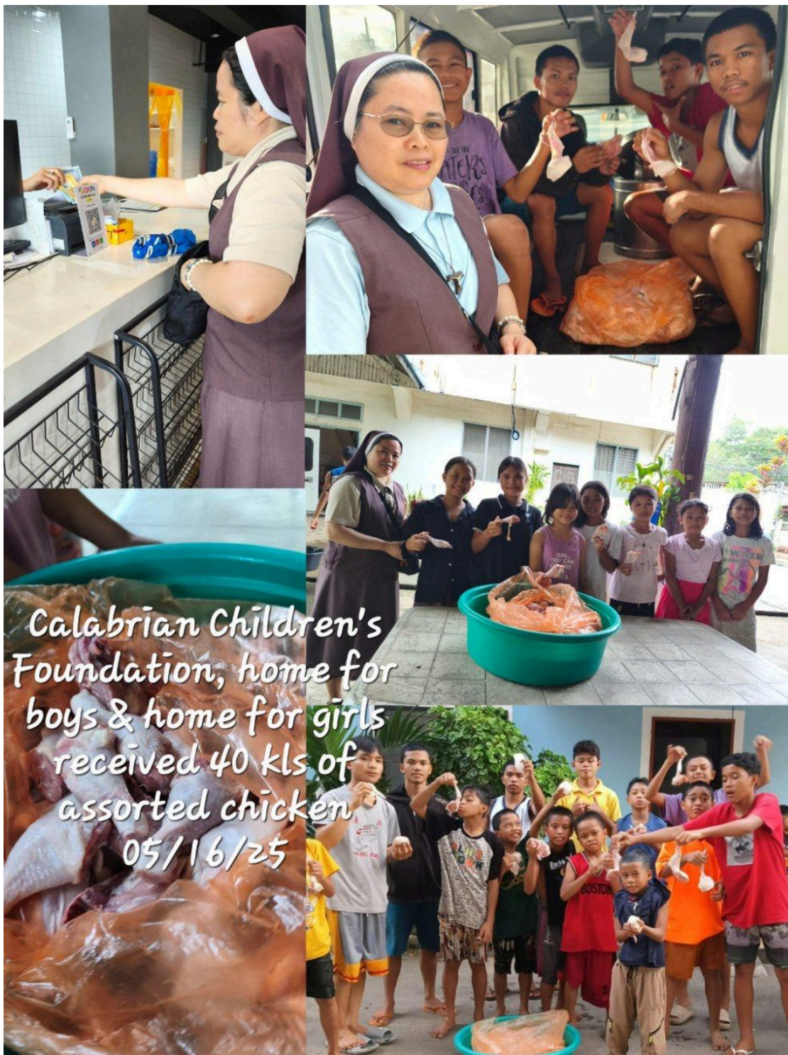
Calabrian Children's Foundation, home for boys & home for girls received 40 kls of assorted chicken 05/16/25