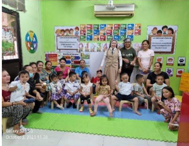
Galaxy S21 5G October 3, 2023 11:38