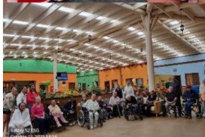
Galaxy S21 5G October 27, 2023 15:24