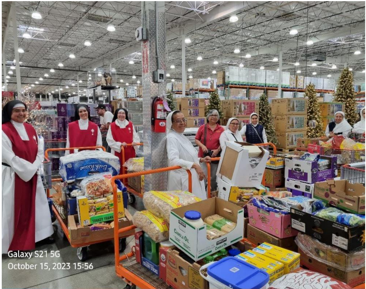
Galaxy S21 5G October 15, 2023 15:56