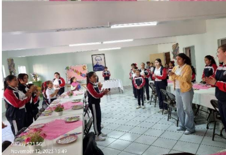
Galaxy S21 5G November 12, 2023 13:49