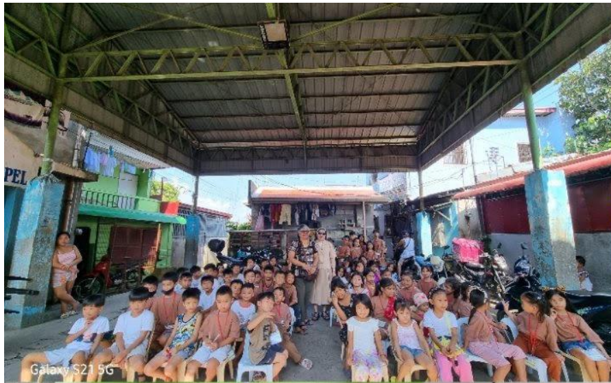
Galaxy S21 5G