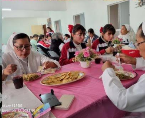
Galaxy S21 5G November 12, 2023 14:43