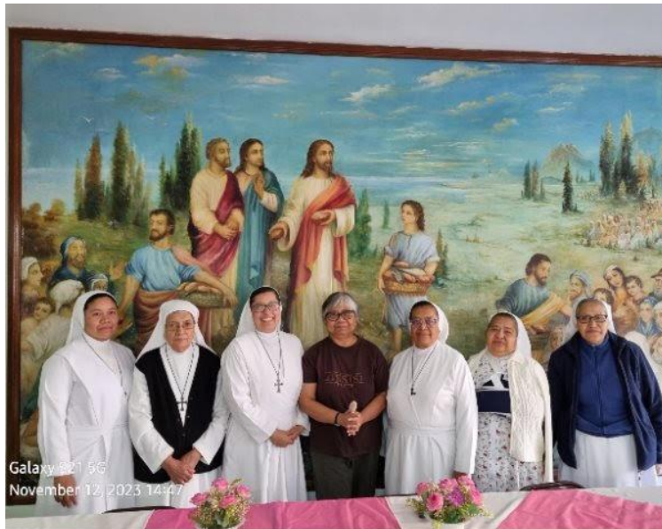
Galaxy S21 5G November 12, 2023 14:47