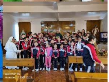
Galaxy S21 5G November 10, 2023 15:15