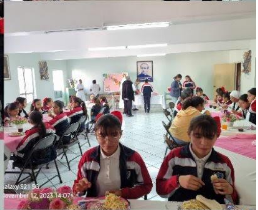
Galaxy S21 5G November 12, 2023 14:07