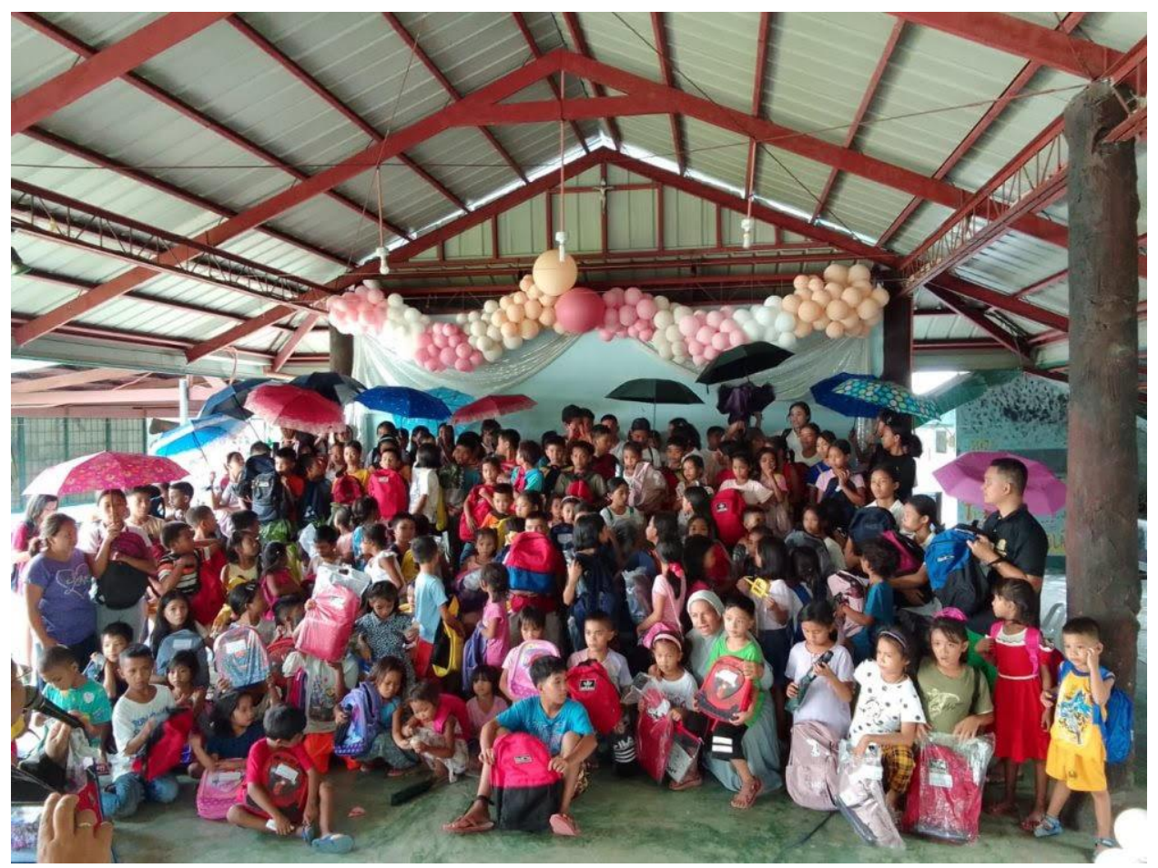
09/02/23, Saturday. "After the vacation of the children for almost 4 Saturdays, the children were very excited to come to our mission house at 7 am, some went to the chapel and prayed. The children wrote their names in the attendance book and then helped the Sisters to clean the yard.